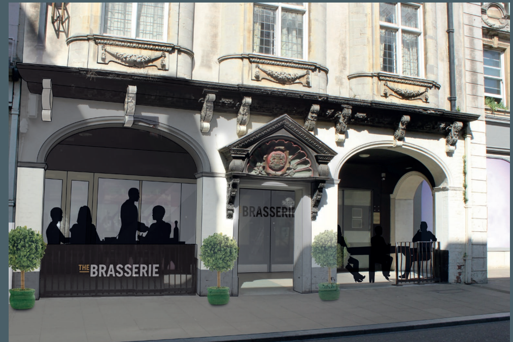
Artist impression of potential usage.