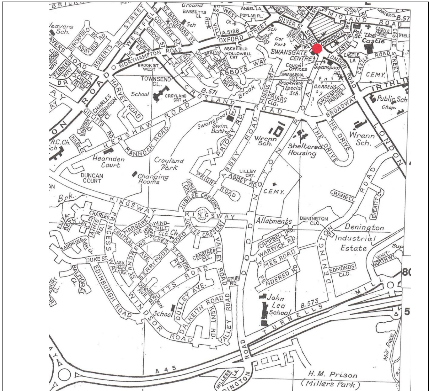
The plan is based on the Ordnance Survey Map with the permission of the Controller of HM Stationery Office. Crown Copyright Reserved.

Phone 01604 629988 • Fax 01604 626247 • Email enquiries@abbeyross.co.uk • Website www.abbeyross.co.uk